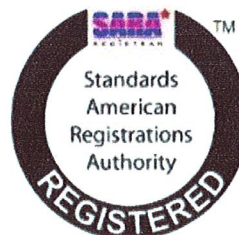
President, SARA Registrar

A handwritten signature in black ink, appearing to read "N. A.", is written over a horizontal line.